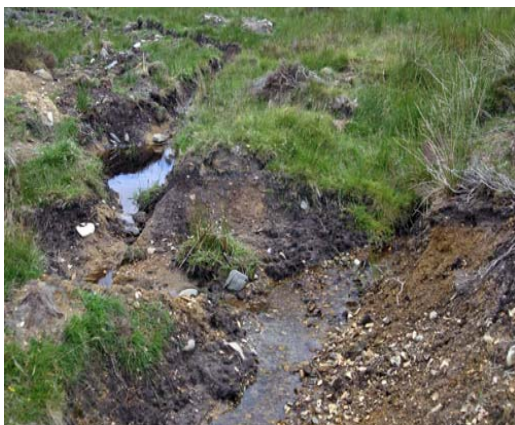
Damage to natural drainage system by ditch

The habitat destruction and land take for a 16 to 53 wind turbine installation is 6.57 to 44.16 hectares. It should be noted that the modification of natural drainage by the construction of roads, ditches, etc. could represent an impact on upland habitat over a much larger area. Modification of peatland drainage by the use of ditch systems associated with wind turbine developments is likely to lead to drying of peatlands, ultimately resulting in erosion of habitats over a wide area 4 . The size of area is comparable to the land take for the agricultural production of biofuels or other industrial facility. The habitat damage is also similar to the effects of climate change on upland areas.