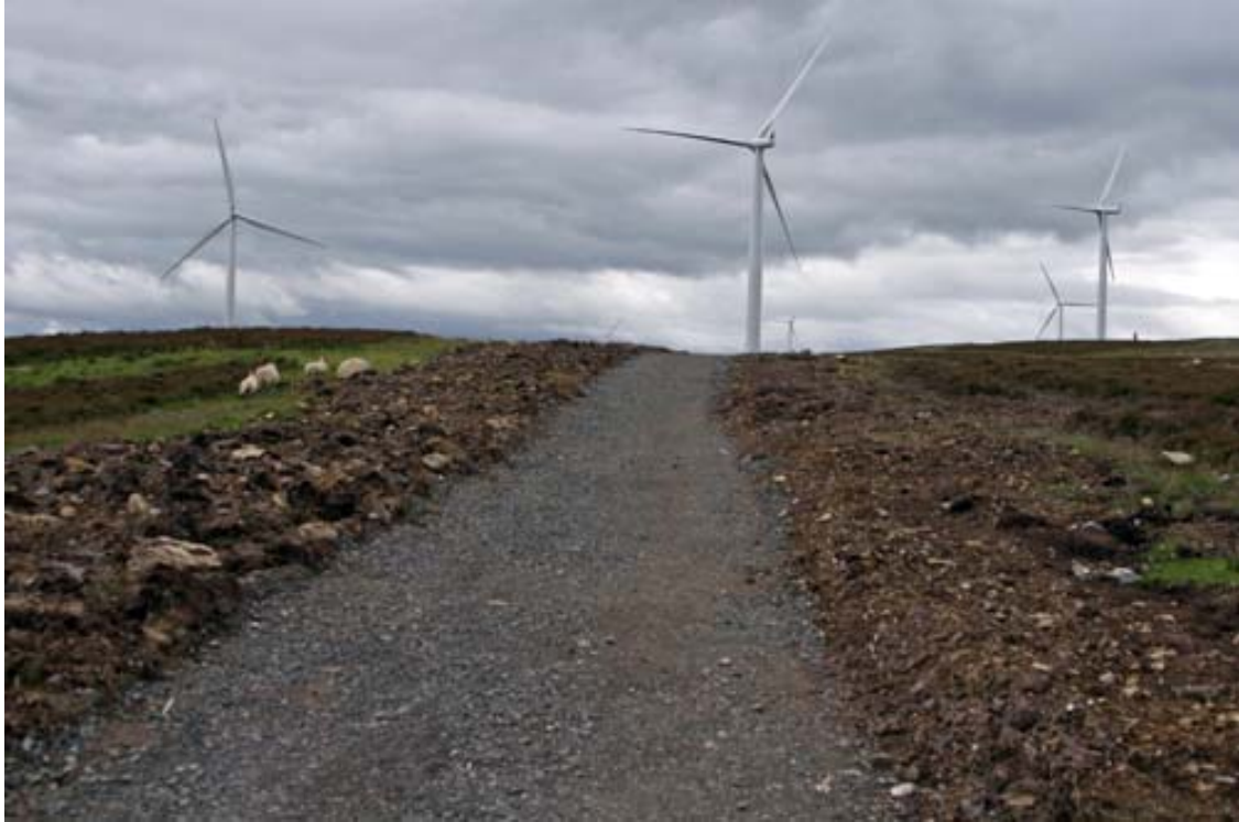
Wind turbine road showing 5 meter wide area of disturbance and habitat damage

What does an industrial scale wind turbine development look like? At first sight it would appear that there is very little land “take” or disturbance around a modest development of 16 turbines or a larger development of 53 turbines.