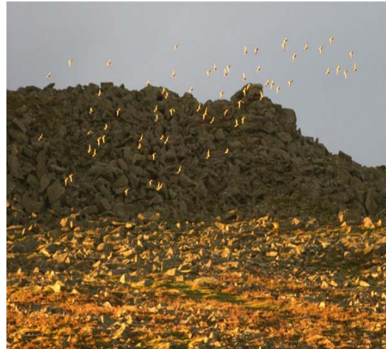
Golden Plover over an unspoilt upland

Independently peer reviewed research is now also indicating that the impacts of wind turbine developments may not be limited to direct impacts from construction and operation. Recent scientific research by the Royal Society for the Protection of Birds (RSPB) indicates that wind turbine sites are having a cumulative negative impact on some peatland birds.