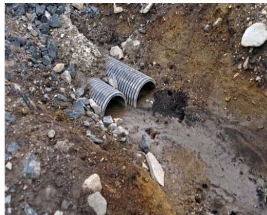
Erosion and siltation problems on site

In addition EU policy, derived from the Gothenburg Agenda, does not appear to be properly applied to renewable energy projects. For example, the Braes of Doune wind turbine development, built adjacent/ within the River Teith Special Area of Conservation, has been shown to have identical impacts on upland ecosystems as climate change would have 10 . Having visited several similar upland facilities, the Trust fears that these impacts may be widespread across the upland ecosystems of Scotland where wind turbine installations and infrastructure have been sited.