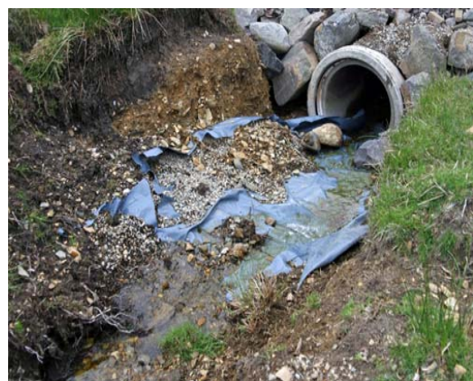
Erosion damage and poor protection on site

Recent research in the uplands of Scotland gives rise for concern with regard to locating renewable energy projects in sensitive areas. Impacts from climate change may now be worsened by the construction of wind turbines in upland areas.